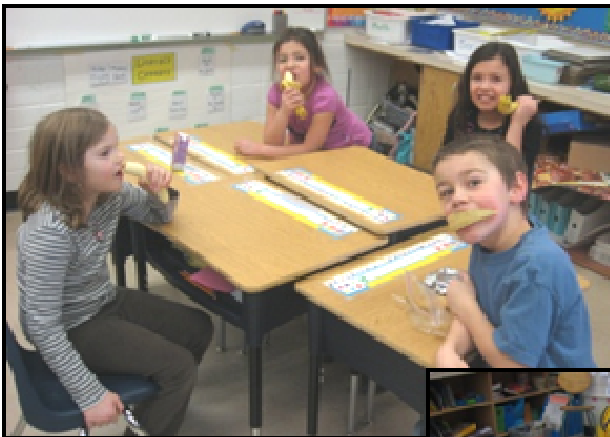
Grade One/Two students showing off their healthy snacks!