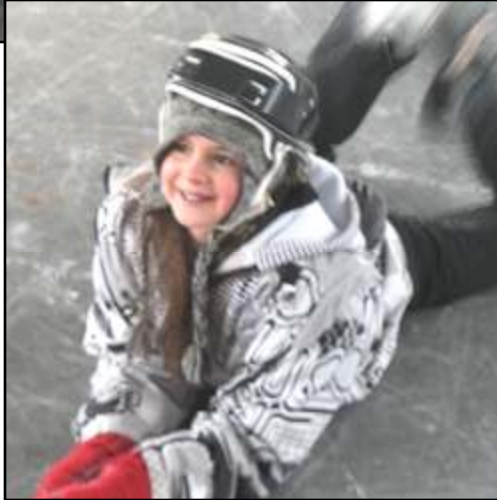
Skating at the Rink Students were out at the rink this week as part of our regular physical education program.